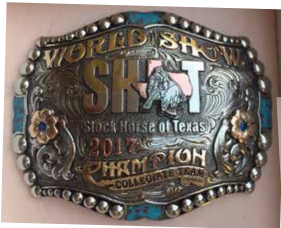
Collegiate Team, Division I & Division II

Plus tack and several other great prizes!!