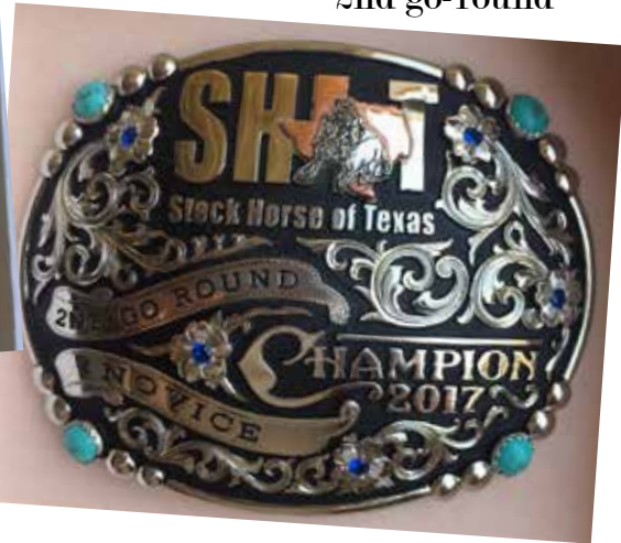
Overall World Champions